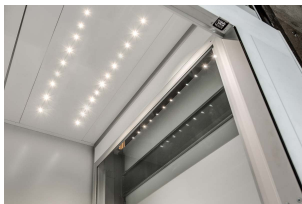
Shaft ceiling with LED spotlights, available as option.

Manufactured for loads of up to 1000 kg and based on a reliable screw and nut driving system, the A8000 represents the best alternative for existing building projects. Delivered with its own steel shaft enclosure and with the same premium design of the A5000, the A8000 represents the best solution to increase accessibility in public environments.